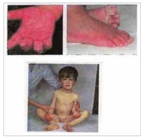
Mercury Poisoning in Children from Teething Powders Pink Disease (Acrodynia)

The visual evidence after using these pads is not only compelling but give us a low cost method of testing our levels of toxicity while we simultaneously detoxify. By simply removing the patch we can actually see some of the materials that have been ?suctioned? out of the body. Our progress is apparent when we see what comes out onto the pads when used over consecutive days, weeks or months. Though it seems the clay rings in the bathtub have not been tested companies that sell these patches have sent the used pads to the SCR Analytical Lab, which is a highly accredited Environmental Laboratory. The results demonstrated absorption into the patchs of nickel, arsenic and mercury, as well as benzene, isopropyl alcohol, methyl alcohol, aluminum, cadmium, copper, lead, thallium, asbestos, DAB dye, fast green dye, sudan black dye and PCB (plastic byproduct).